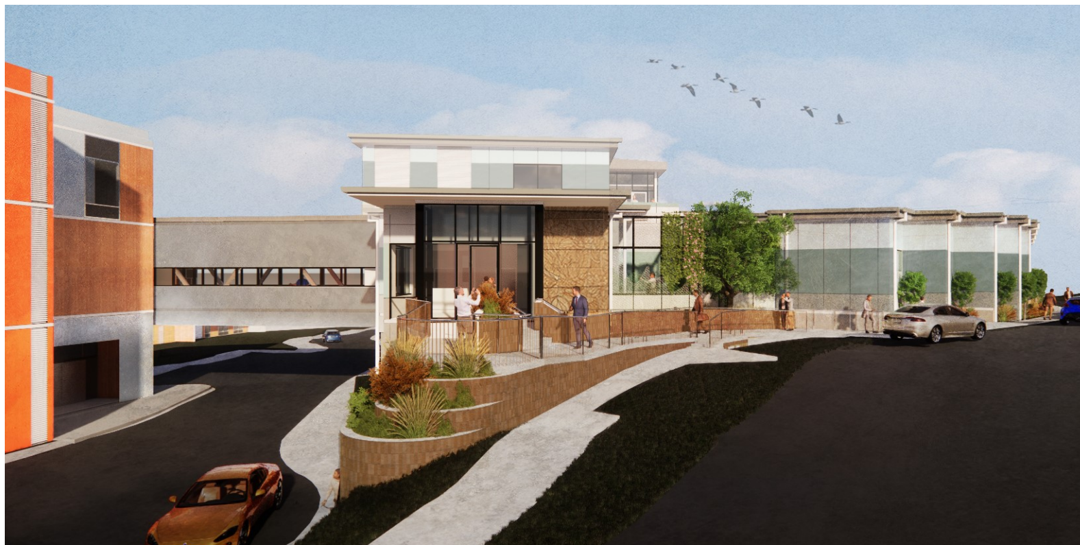
Above: An artist impression of the new unit's entry and its connection to Tamworth Hospital on the left.

We still have more work to do during the next and final design stage known as Detailed Design. The design is expected to be completed by early next year, with construction forecast to commence in mid-2022.