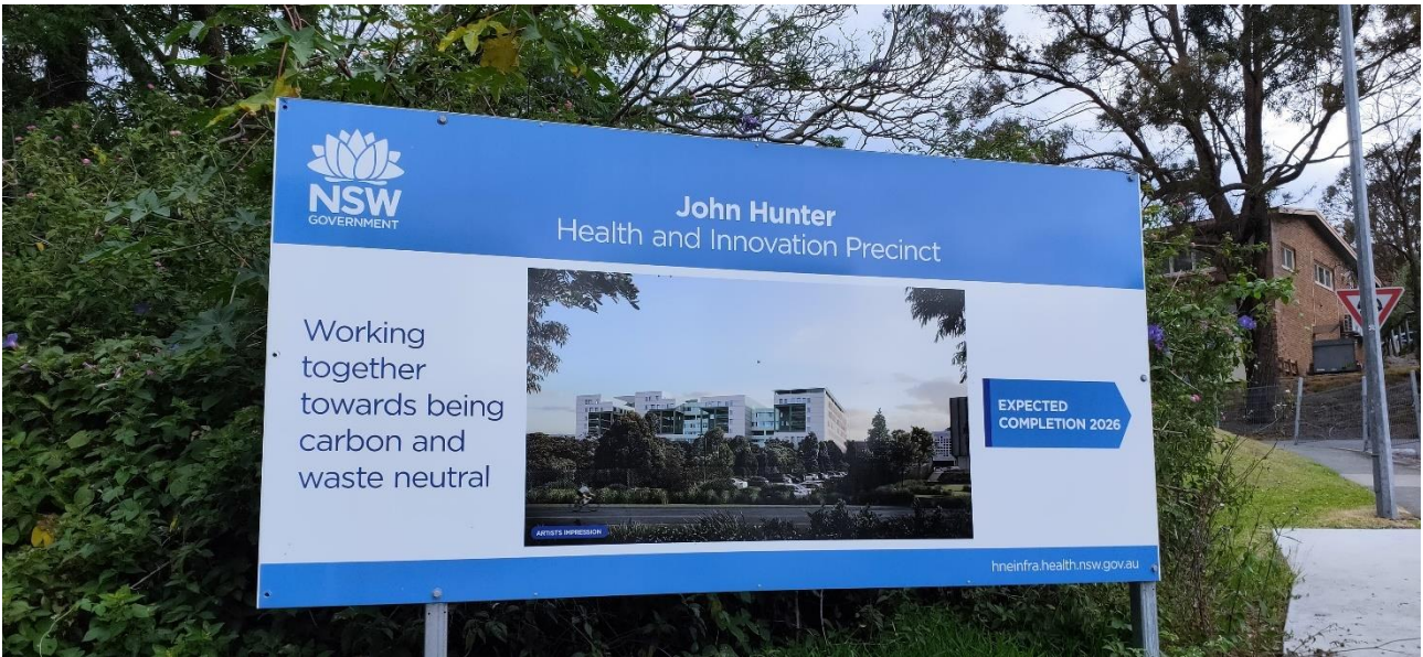
Photograph 1 – Project Signage off Kookaburra Circuit