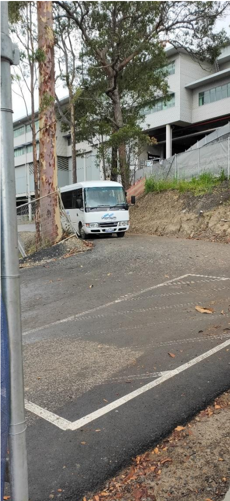
Photograph 4 – Temporary access road sealed and shuttle bus