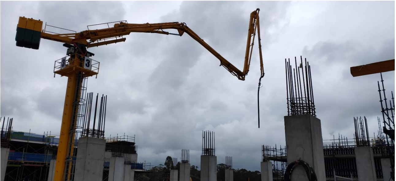
Photograph 6 – ASB looking west across B3/B4 levels