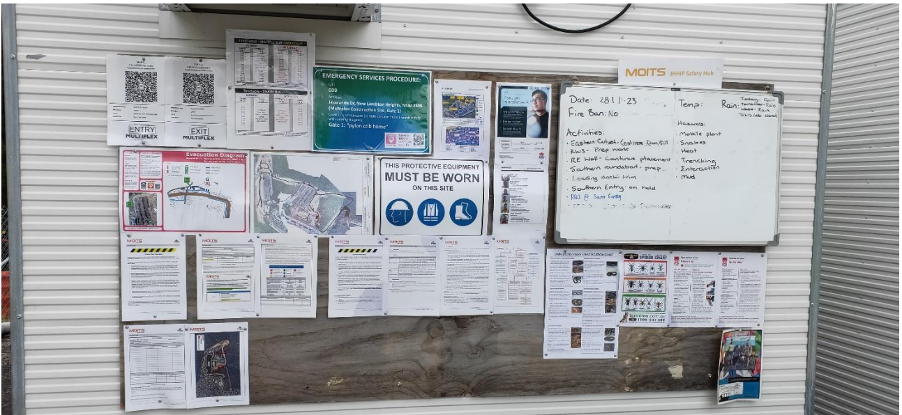
Photograph 10 – Site Notice board