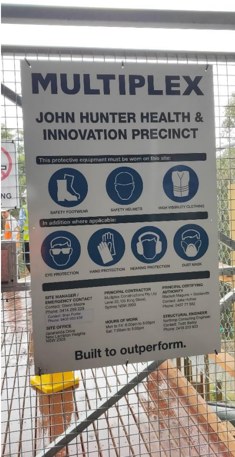
Photograph 2 – Site Signage