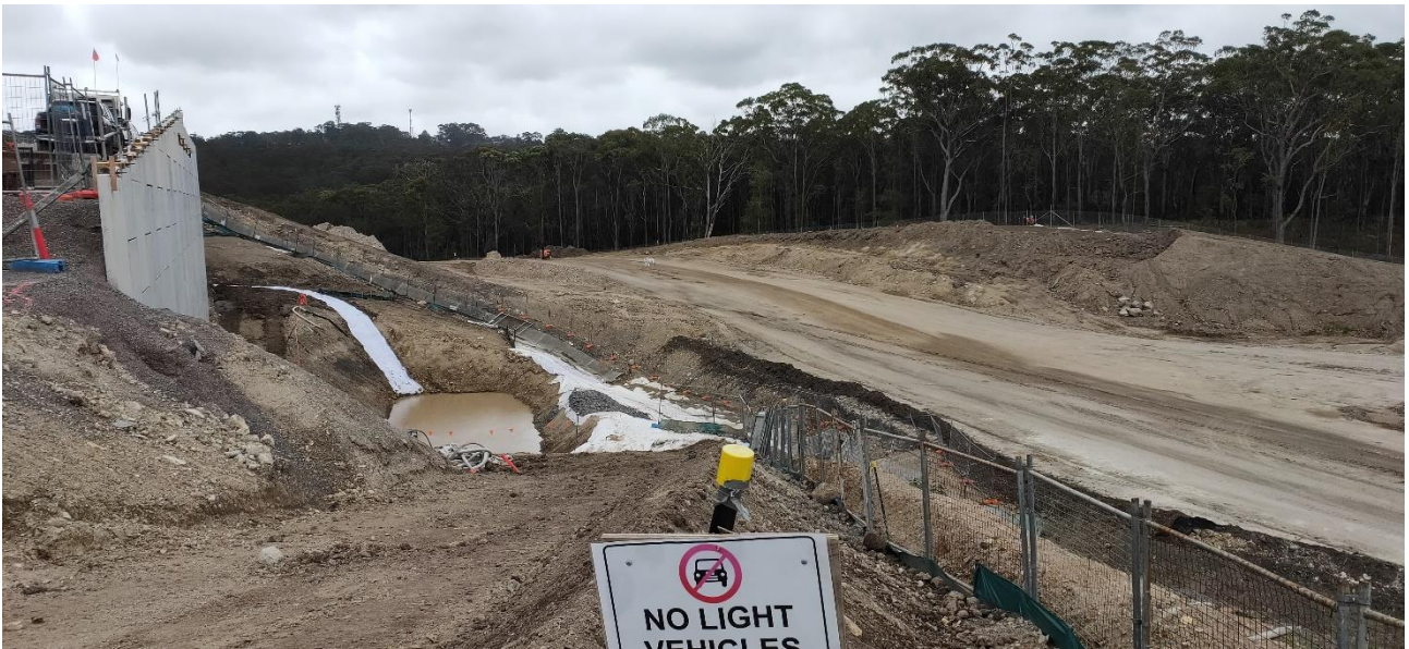
Photograph 7 – Basin subject to incident report below retaining wall for access road