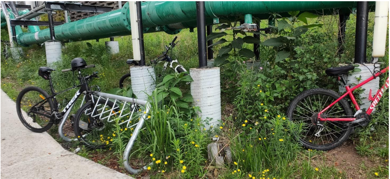
Photograph 9 – Bike rack and bike usage on project