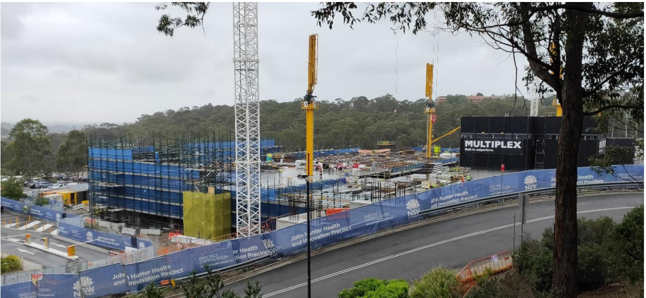
Photograph 3 – ASB looking East