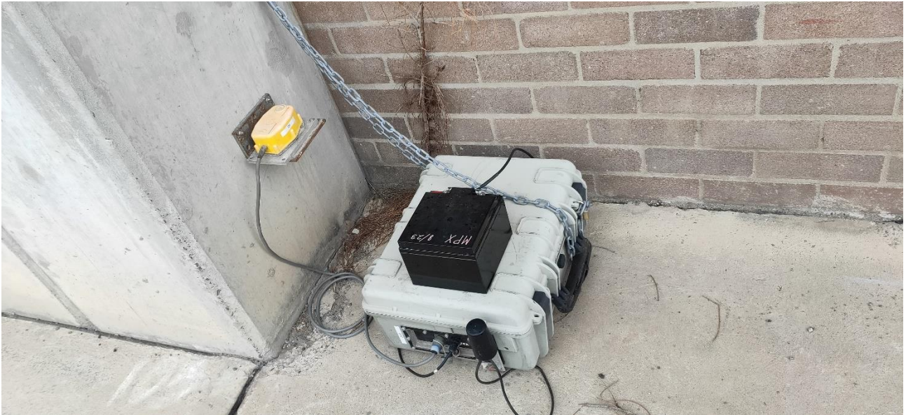
Photograph 8 – Vibration monitoring equipment off Kookaburra Circuit on JHH building