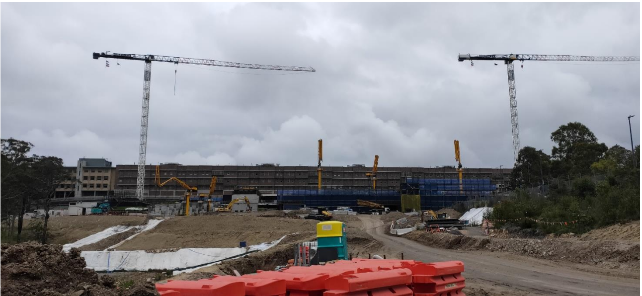
Photograph 5 – ASB looking South