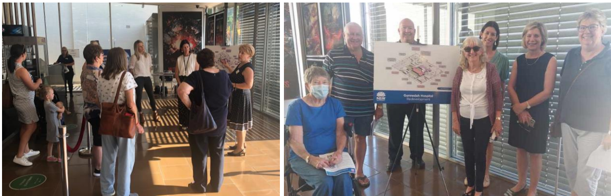
Images: the project team engaging with PRAMs and community members in Gunnedah in March 2022.

www.hneinfra.health.nsw.gov.au/projects/gunnedah