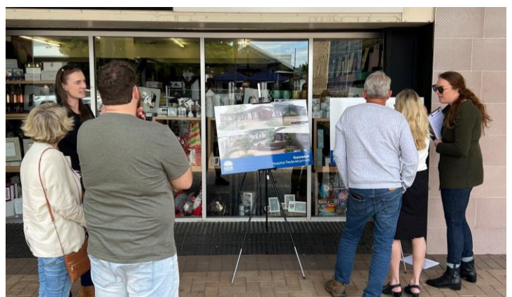
Images: the project team engaging with staff and community members in Gunnedah in November 2022