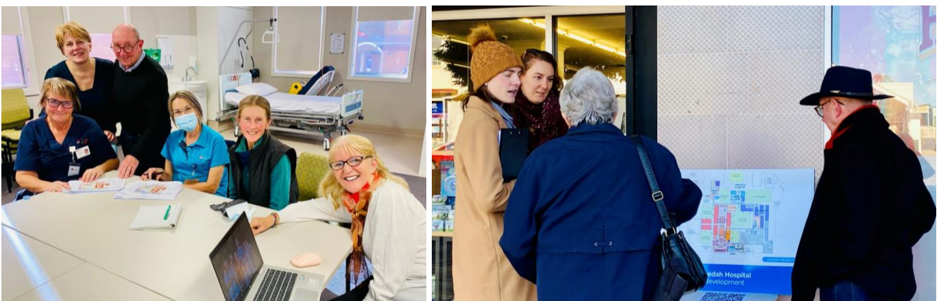
Images: the project team engaging with staff and community members in Gunnedah in June 2022.

www.hneinfra.health.nsw.gov.au/projects/gunnedah