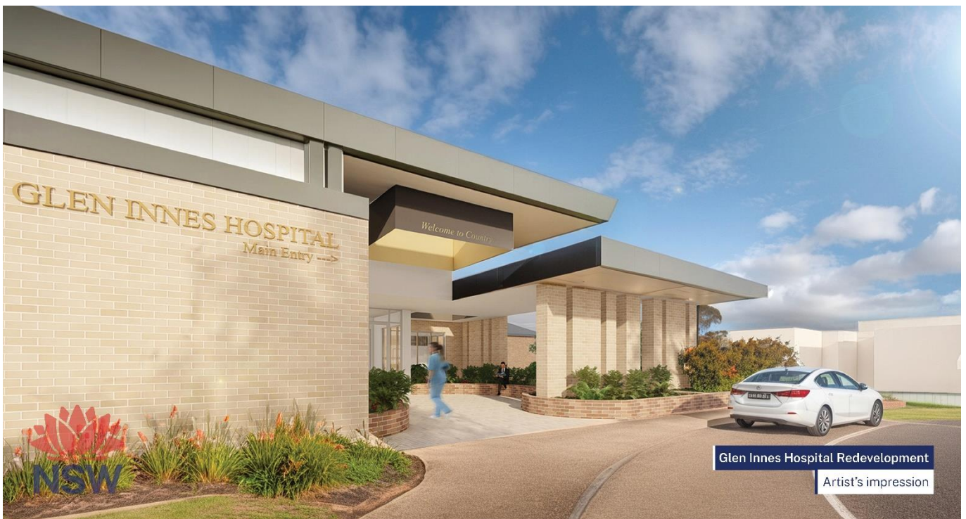
Image: Artist's impression of the main entry and drop-off zone, with the Museum buildings visible in the background.