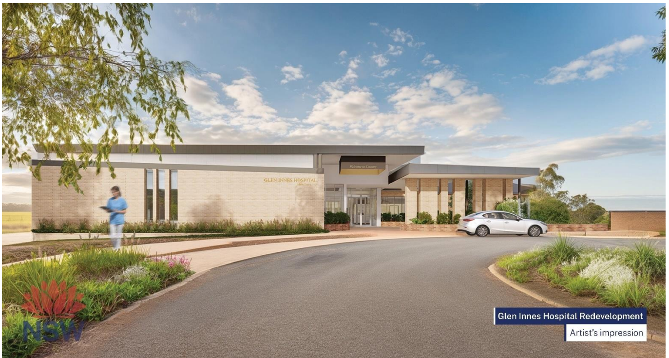
Image: Artist's impression of the new main entry accessed from Ferguson Street.

The demolition of the old nurses building that was completed in late 2023 will allow for the construction site compound and support the delivery of the full master plan in the future. The Spanish Flu Building will be retained in this stage of the redevelopment and access for the neighbouring Museum will remain as is from Ferguson Street.