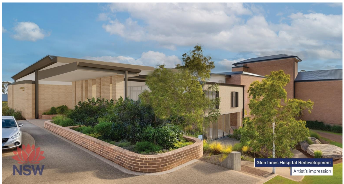
Image: Artist's impression of the new building (lighter brick) showing the connection to the existing hospital building (darker brick).