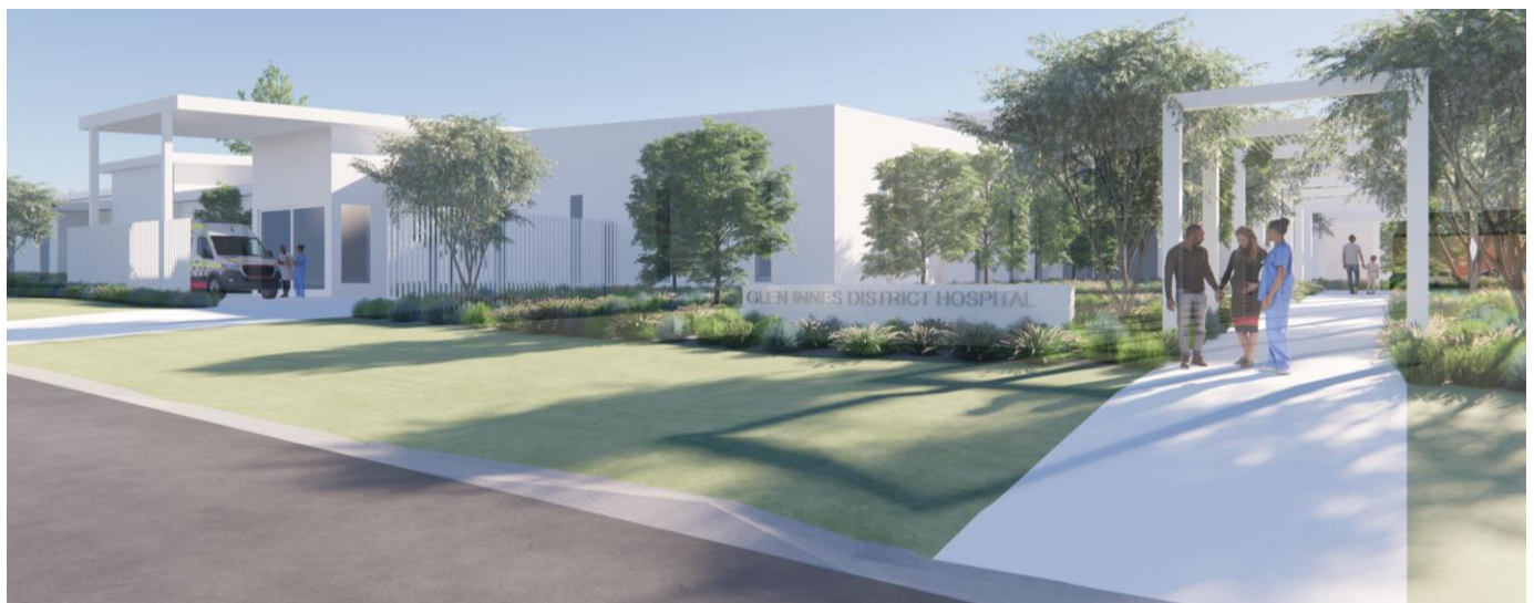
Image: Artist's impression of the new hospital showing the Ambulance access and pedestrian footpath from Ferguson Street

www.hneinfra.health.nsw.gov.au/projects/gleninnes