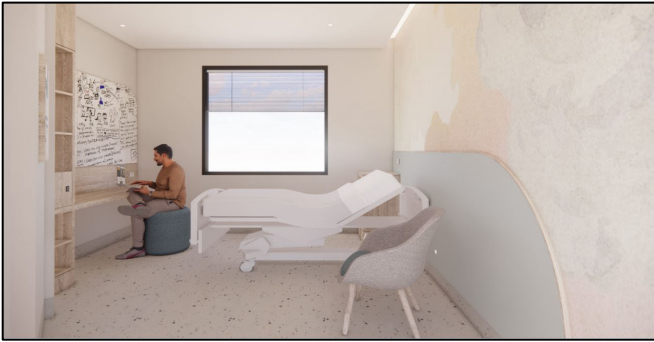
A typical inpatient bedroom. (Artist's impression)