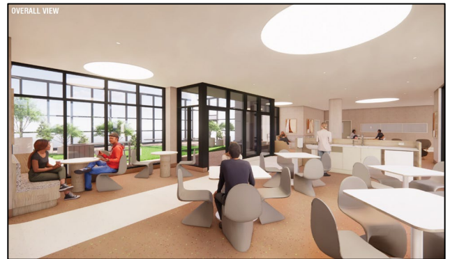
Adult dining and lounge area. (Artist's impression)

Artwork on the floor provides culturally sensitive support for the Aboriginal community to move easily around the building.