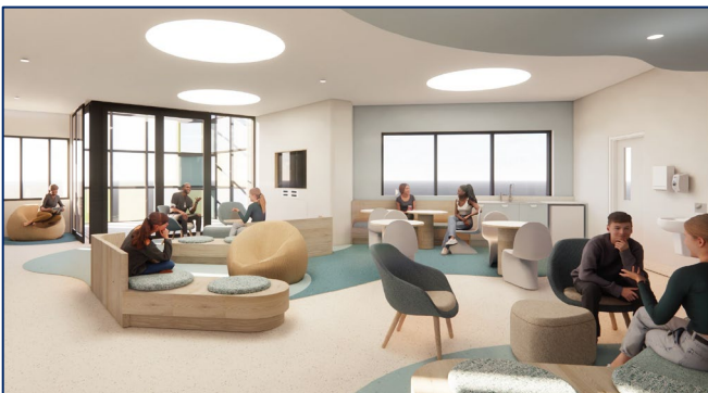
Adolescent dining and lounge area. (Artist's impression)

The project team has actively listened to our community by incorporating feedback in the design to ensure the facility provides a unique connection to the local community and culture.