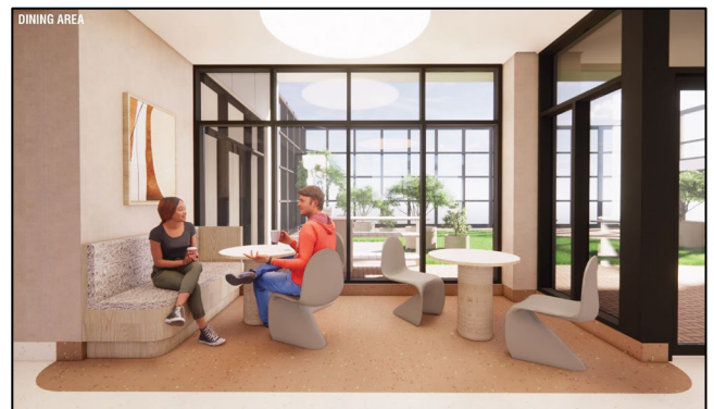
Adult dining area. (Artist's impression)

You can keep up with construction activity related to this project, and how it may affect you, by visiting our interactive map. Simply scan this QR code.